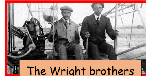
The Wright brothers